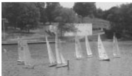
A super shot of a great start at one of last year's Metric Series heats.